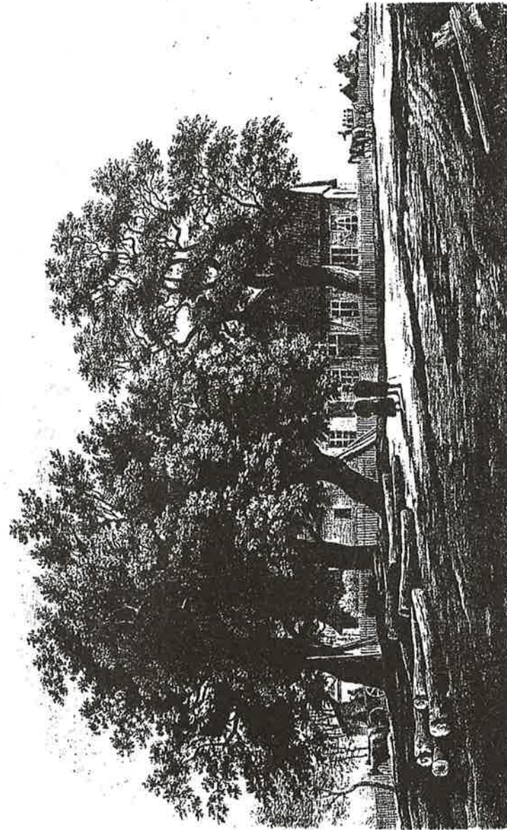
Missionshaus in Hermannsburg.