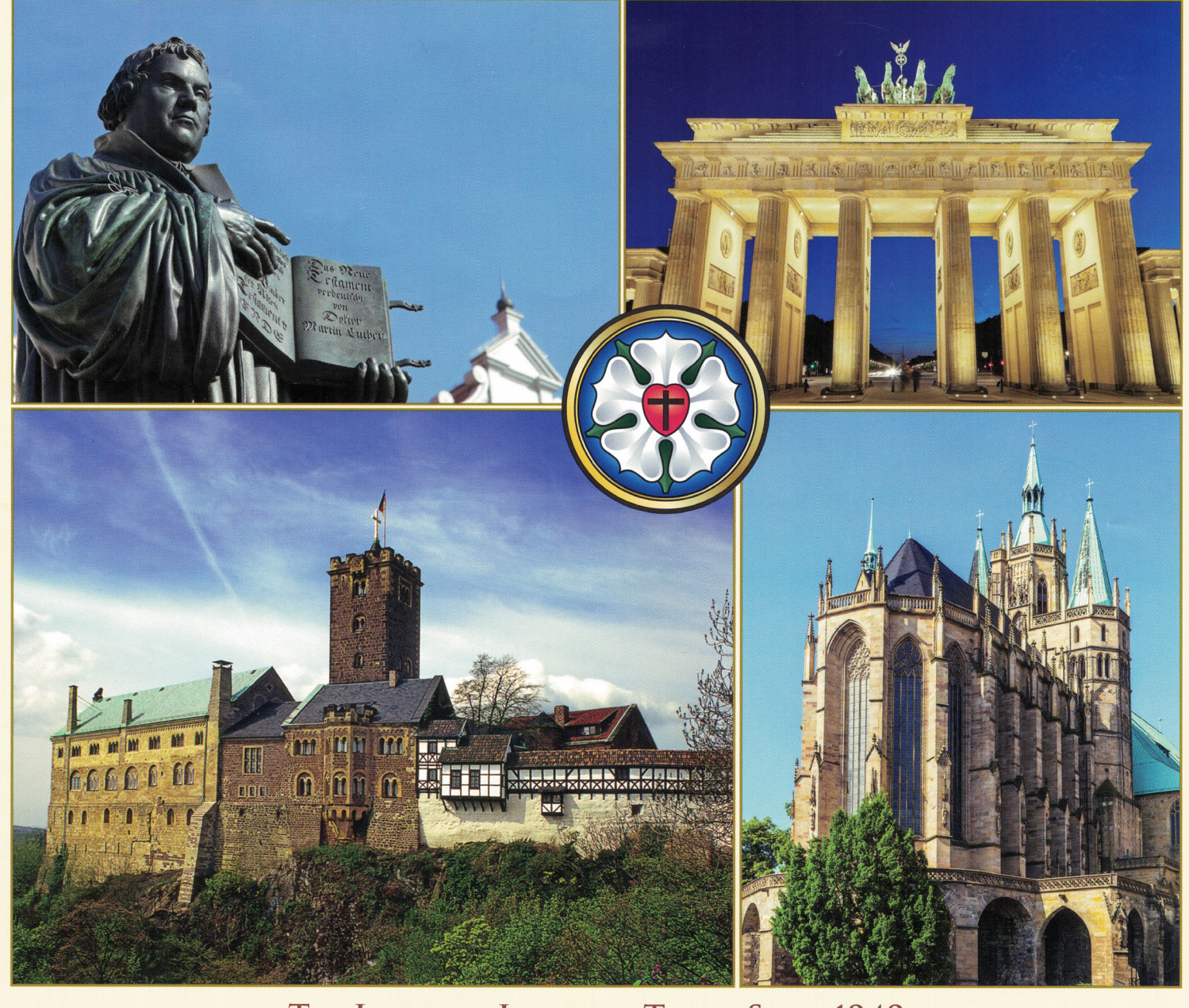
THE LEADER IN LUTHERAN TRAVEL SINCE 1949

(Air/land tour price is $2949 plus $690 government taxes/airline surcharges.)